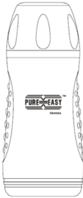
PUREEASY Patent Product